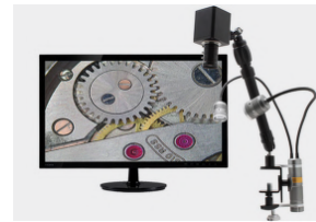
Mighty Cam - Microscopy