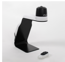
Cmore Digital camera microscope