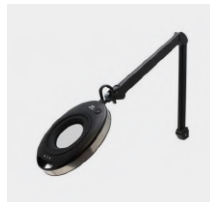
Magnifying Lamps & Accessories