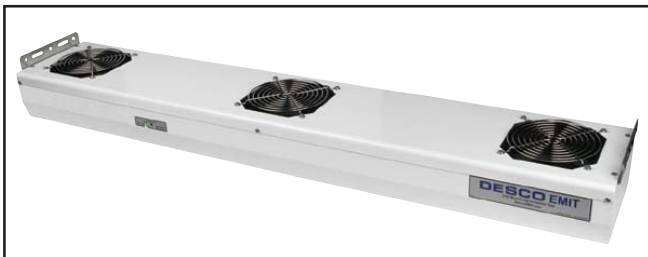
Figure 1. Desco Emit Overhead Ionizer