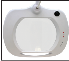
7.5" x 6.2" / 3-Diopter Lens 1.75x Magnification

Covered Spring Balanced Arm No Pinch Hazards