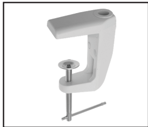
Heavy Duty Mounting Clamp