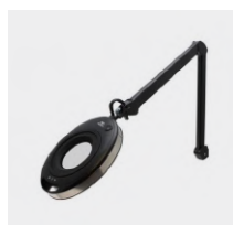
Magnifying Lamps & Accessories