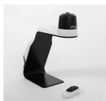
Cmore Digital camera microscope