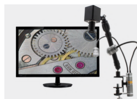
Mighty Cam - Microscopy