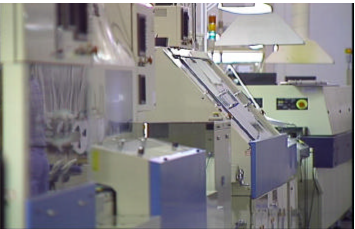
A high-volume SMT assembly line.

applied and the components are placed on the board, the only way to create a functioning circuit board is an effective solder reflow process.