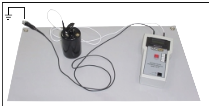
Figure 4. Setting up for Rg testing.

If measurement is outside acceptable limits, clean surface & retest to determine if cause of failure is insulative dirt layer or the ESD protective product. Note: Use an ESD cleaner containing no insulative silicone (i.e. Reztore™ Antistatic Surface and Mat Cleaner)