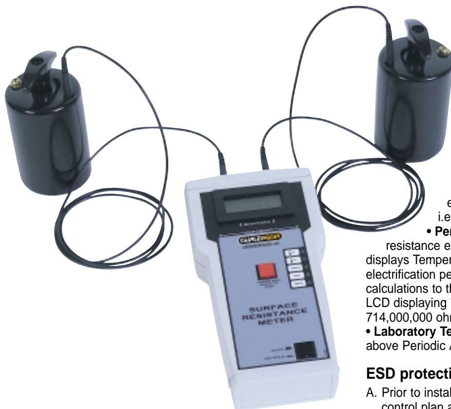
Figure 1. Item 99105 Surface Resistance Test Kit